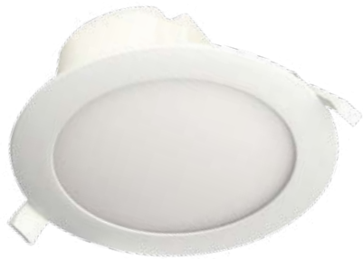
6" Dimmable EdgeLit Downlight