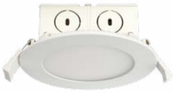
4" Dimmable EdgeLit Downlight