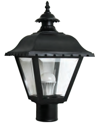
84495 CLEAR | BLACK