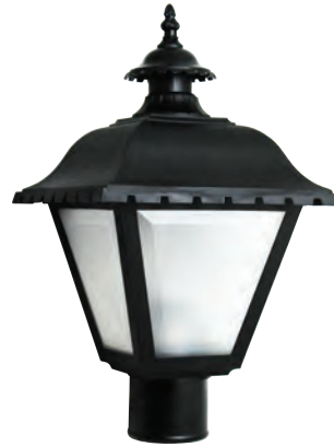
84465 FROSTED | BLACK