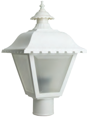
84461 FROSTED | WHITE