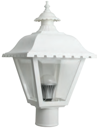
84491 CLEAR | WHITE