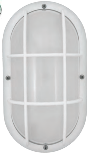
33561 | WHITE