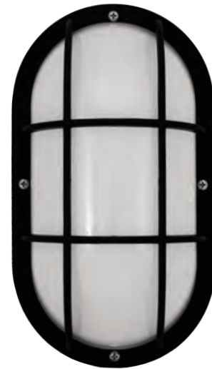
33565 | BLACK