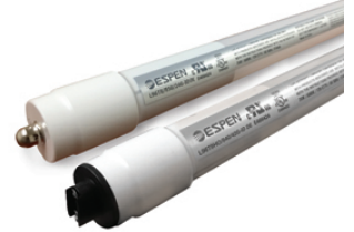
Internal Driver LED T8 Lamp Double End Input