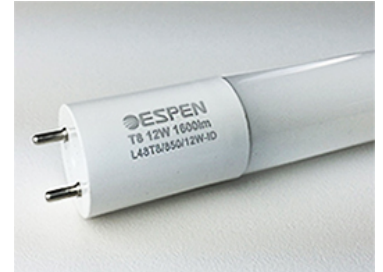
Commercial Grade LED T8 Lamp