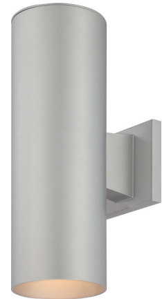
Surface Wall Mount E: 7¾"