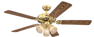
Reversible Oak Finish Blades