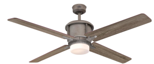
Reversible Pewter Ash Finish Blades