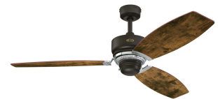
Reversible Reclaimed Hickory Finish Blades